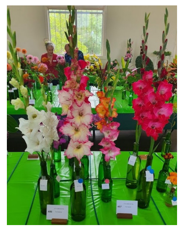
Exhibits of Gladioli