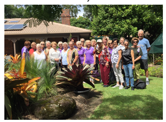
on a plant hunt escapade at Timbara (Plants Plus) Nursery, Fame

For the afternoon we called into Indigiscapes to see the new transformation then went on a plant hunt escapade at Orchids and Capalaba Nursery.