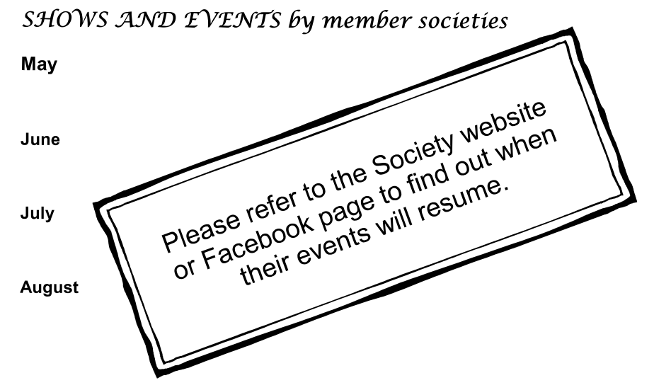
All events in the Auditorium, Brisbane Botanic Gardens, Mt Coot-tha have been cancelled until 31 August.

Please advise Secretary of any shows in September, October, November, December to be included for July issue.